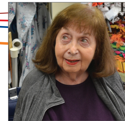
Lorraine Friend Lieberman Center Resident