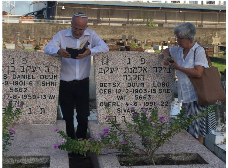
Cleaning the graves of loved ones before Yom Kippur