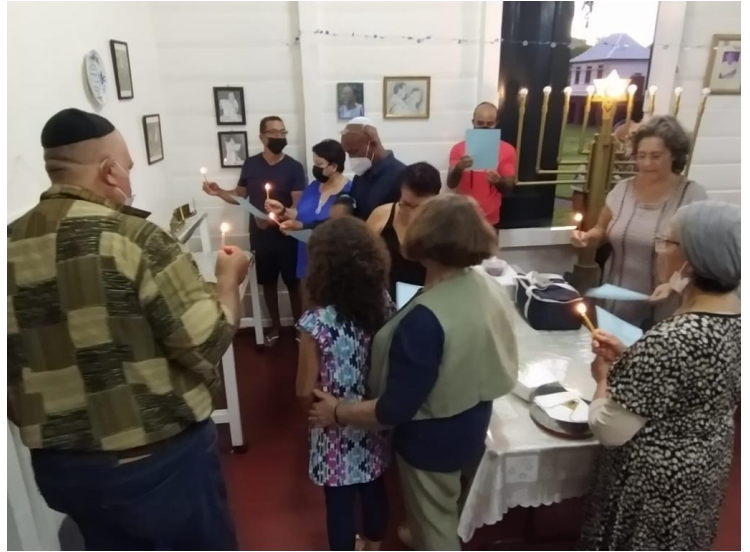
Lighting the Hanukkah candles in the Mahamad (our small community hall on the synagogue grounds)

Each family lit their own Menorah in the Mahamad (our community hall). The place was full of light during the dark days of shutdowns.