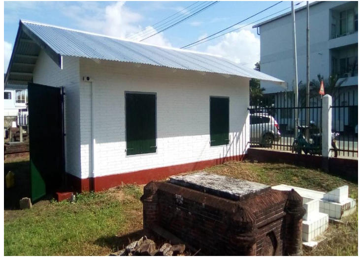
...and after the roof replacements