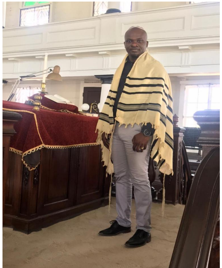
Ambassador Noordzee visiting our beautiful Neve Shalom synagogue