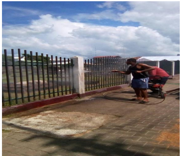
The clean-up of the cemetery fence before painting

As a result of attempted vandalism and weather related deterioration, sections of the cemeteries' fences had to be restored and repainted. This is a very expensive job as it had to be done in our three cemeteries: The Old Ashkenazi cemetery and the two active cemeteries: the Sephardic and Ashkenazi ones. This is an issue we have talked about in previous newsletters.