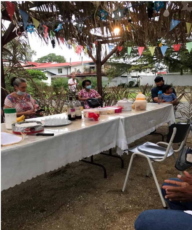
Sukkot gave the Community an opportunity to meet and Socialize in the Sukkah after weeks of lockdown