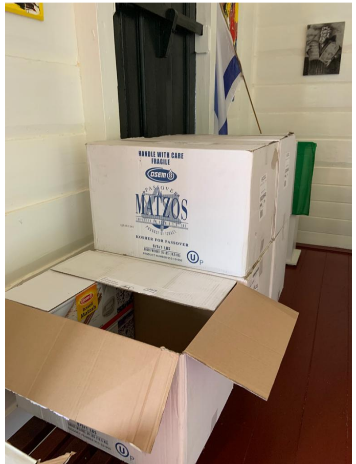
The Matzot boxes have arrived from the airport on time

We are so grateful for the financial support of our Chai members. With your support we are able to buy our products. (The community is paying the air and sea transportation that is the major component of the cost).