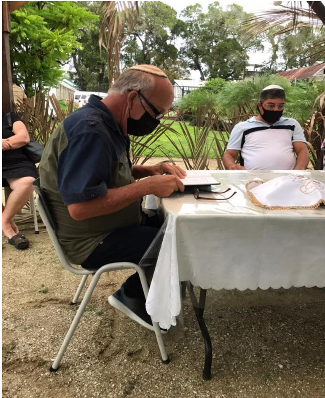
The Sukkah on our Synagogue grounds